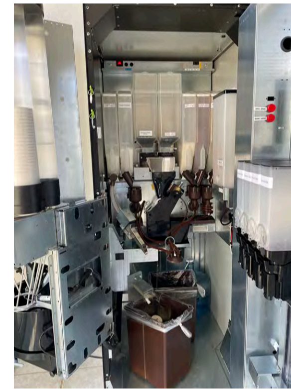
A stainless steel interior for a more durable environment